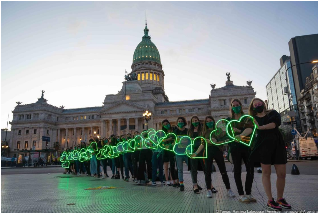
↑ Amnesty International Argentina action outside the Palace of the Argentine National Congress in Buenos Aires, marking the first anniversary of the legalisation of abortion in the country, 30 December, 2021

“With increasing sensitization, values verification and attitudes transformation training, I hope more people will be sensitized. Increasing provider networking is important in improving the enabling environment” – Gynecologist, Nigeria