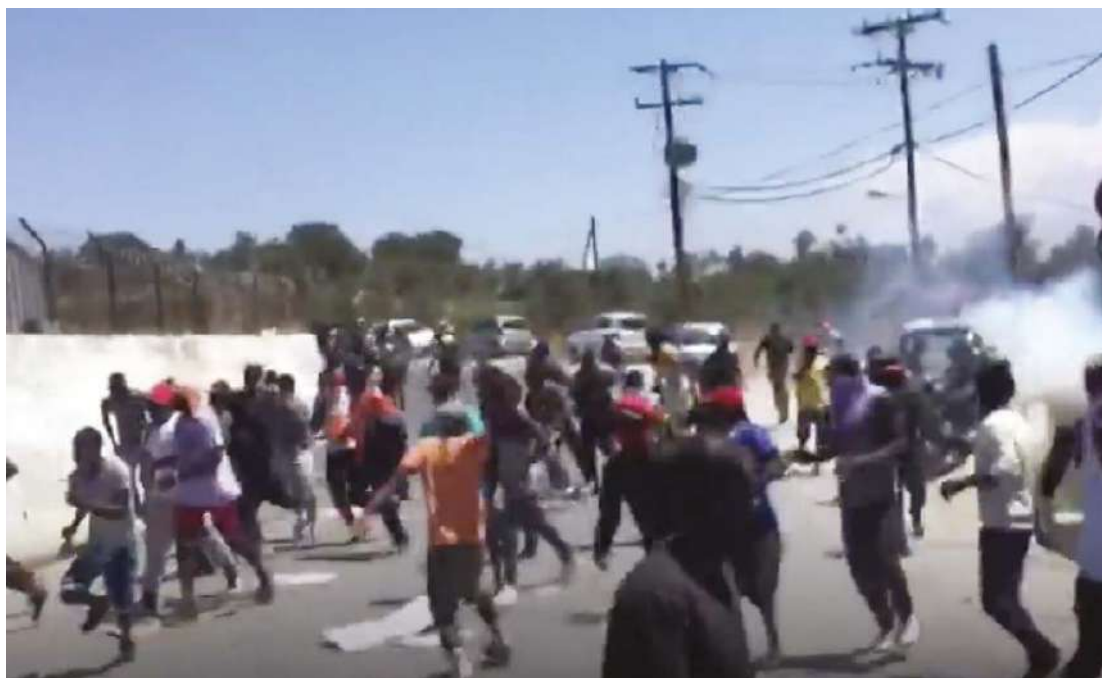
Screengrab from phone footage taken in Moria Camp on 18 July 2017