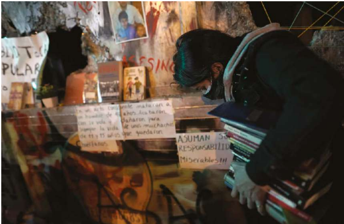
Handwritten protest notes alluding to police abuse during the third day of unrest sparked by the killing of Javier Ordoñez by the police of Bogota on 11 September 2020 in Bogotá, Colombia.

On 9 September 2020, Javier Ordoñez was stopped by police near his home Bogotá, Colombia, for allegedly violating the selective isolation rules established in the context of the COVID-19 pandemic. The officers pinned him to the ground and administered repeated electric shocks to his body for approximately five minutes using a USA-manufactured Axon Taser X2. Javier Ordoñez, who was heavily restrained and posing no threat to the officers, repeatedly pleaded with them to stop, as did witnesses who were filming the incident a few metres away. He died in the hospital hours later as a result of the blunt trauma injuries from baton strikes.