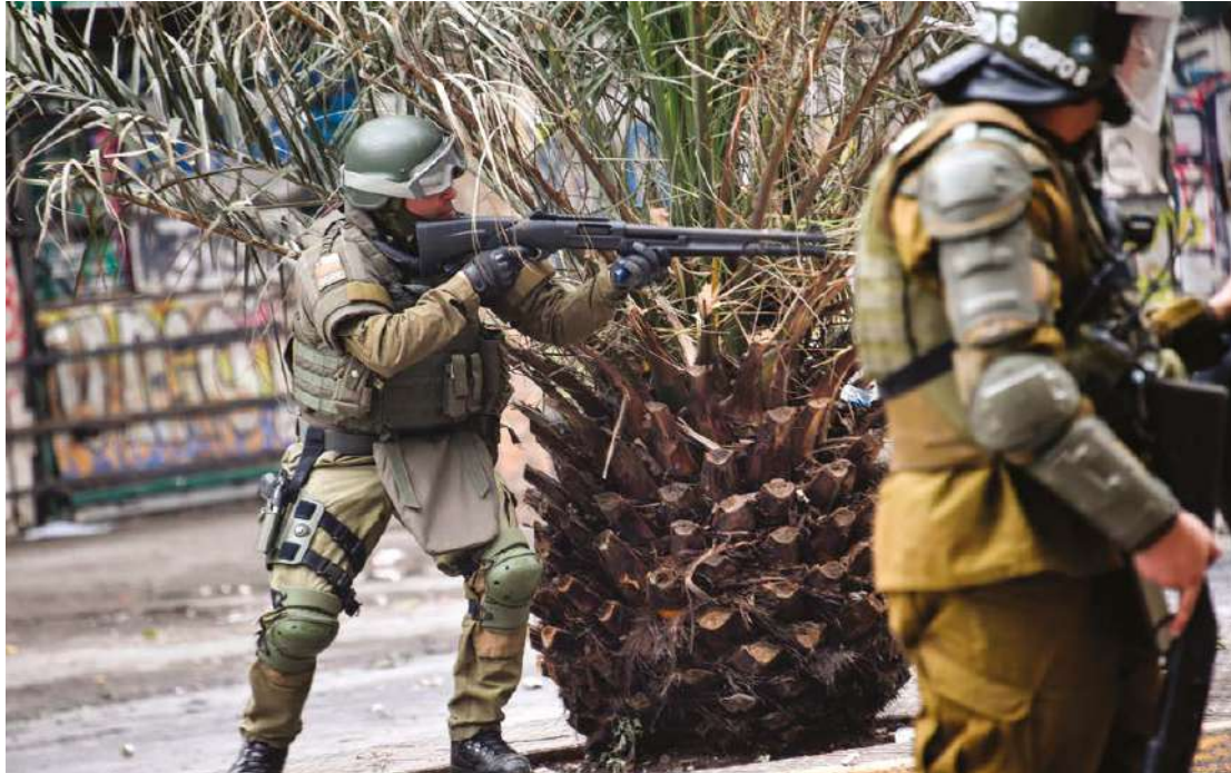
Riot police fire rubber bullets during clashes with demonstrators during protests in Santiago, on 8 November 2019