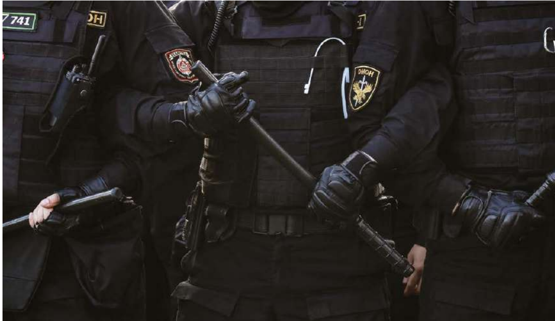
Minsk, Belarus – 13 September 2020: Riot police form a human chain during a protest of opposition supporters in Minsk.

A local human rights activist in Burundi, who was beaten by police.