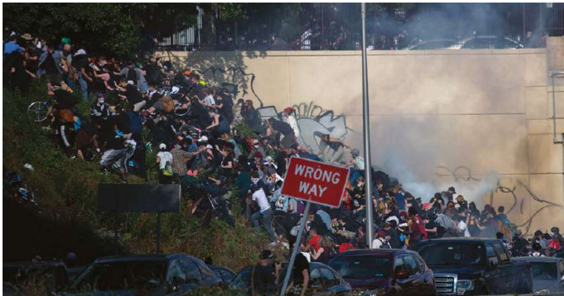
Philadelphia, PA – 1 June 2020: Protesters race up a hill after being shot by tear gas after a march on 1 June 2020 in Philadelphia, Pennsylvania.

Protester in the Vine Street Expressway, Philadelphia, USA, 1 June 2020