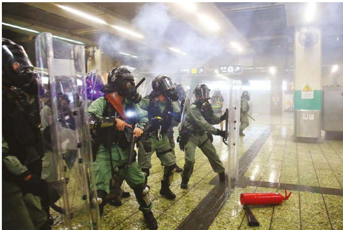
Police fire teargas in the MTR station at Kwai Fong on 11 August, 2019, Hong Kong.

THE USE OF SPRAYS WAS CLEARLY UNNECESSARY AND DISPROPORTIONATE AS THE MAN POSED NO THREAT AND IN FACT BEHAVED PASSIVELY THROUGH THE WHOLE ORDEAL.