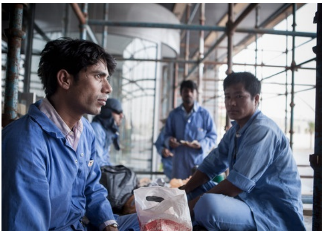
Migrant workers pause to eat at the Sports City area of Doha, Qatar.

A new minimum wage came into force in 2020. Nonetheless, wages in Qatar not only remain low for many migrant workers but are sometimes delayed or not paid at all. This has severe consequences for workers and their families, preventing them from escaping debts incurred from paying recruitment fees, and often trapping them in cycles of abuse and exploitation. A number of initiatives since 2015 have attempted to identify and prevent wage theft, but the issue continues on a significant scale. The authorities should increase and review the minimum wage, strengthen wage protection, and outlaw discriminatory practices of paying different salaries to different nationalities.