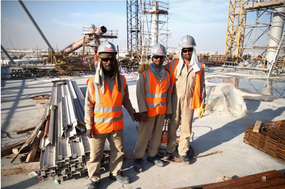
Construction workers in Doha, Qatar, 30 December 2015.

Migrant workers are still unable to form and join trade unions in Qatar, and Joint Committees formed and led by employers, cover only 2% of the workforce. While providing workers with some representation, these remain beset with serious flaws, lacking mechanisms for collective bargaining and failing to provide workers with crucial legal protections. The government must respect its international obligations and allow migrant workers to form and join independent trade unions.