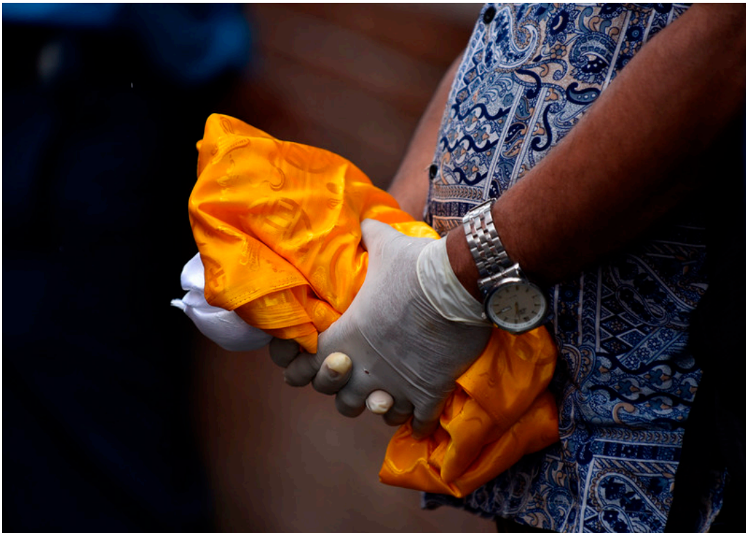
A Family member arrives at Tribhuvan International Airport to take a relative's deceased body for the final ritual in Kathmandu, Nepal on Friday, June 19, 2020.

Migrant workers continue to face major challenges to receive justice and remedy for a range of abuses despite new mechanisms introduced. New Labour Committees increased the number of workers successfully resolving complaints of wage theft but remain beset with shortcomings and delays. A compensation fund has also started to pay out significant amounts to workers offering them much needed relief but is not accessible to all and the amounts paid out have been capped. Qatar must increase the number of judges, accept collective, historic and remote claims and ensure the fund reimburses workers their full dues. It should also ensure migrant workers can access remedy for non-wage related abuses.