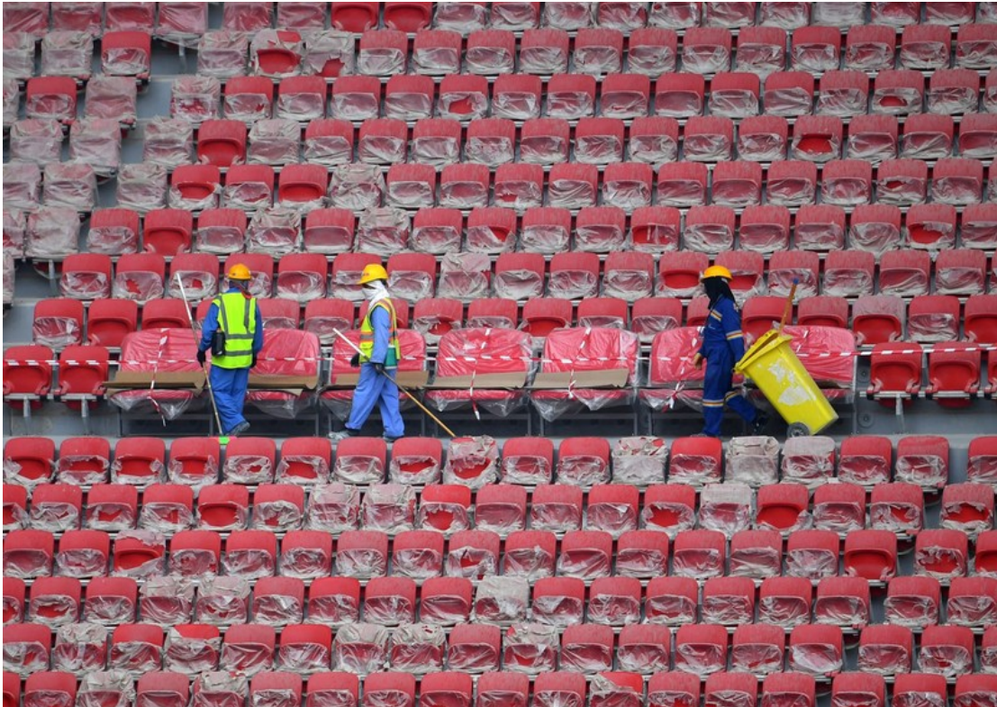
Construction workers in the stands of Qatar's new al-Bayt Stadium in the capital Doha, which will host matches of the FIFA World Cup 2022. © GIUSEPPE CACACE/AFP via Getty Images.

The Workers' Welfare Standards (the Standards) have improved the living and working conditions of thousands of migrant workers falling under the purview of the Supreme Committee, the Qatari body overseeing delivery of the World Cup stadiums. However, some major outstanding issues remain around the extent of enforcement and the small proportion of workers in Qatar covered by the Standards. In addition to strengthening labour laws and enforcement mechanisms, Qatar should learn from and strengthen the Standards and their enforcement, with a view to expand their coverage to more migrant workers across the country.