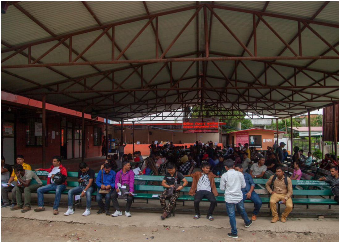
Nepali men wait outside the Foreign Employment Office at Tribhuvan International Airport, in the capital of Nepal, Kathmandu. Many will be prospective migrant workers, bound for the Gulf.

The payment by prospective migrant workers of recruitment fees to secure jobs in Qatar remains rampant, despite Qatar's commitment to tackle the problem. Paying between US$1,000 and US$3,000 in recruitment fees, many workers need months or even years to repay this debt, trapping them in cycles of exploitation and making it difficult for them to challenge or escape abusive employers. Qatar Visa Centres have streamlined the recruitment process in some countries but are not set up to effectively tackle the payment of illegal recruitment fees. The government must work with origin countries to combat such practice and reimburse migrant workers who paid for their jobs in Qatar.