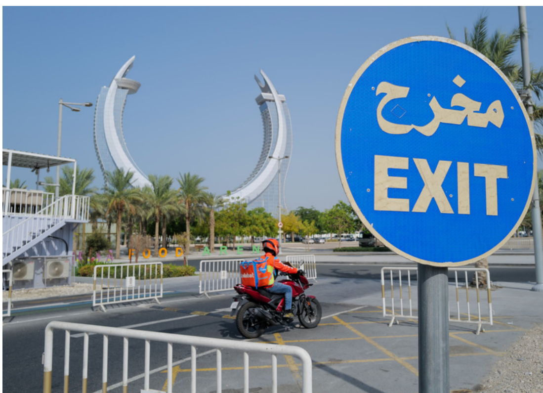
A food delivery worker leaves the Marina Food Area in Lusail City in Doha Qatar, 15 June 2022.

Crucial changes to the inherently abusive kafala sponsorship system mean the vast majority of migrant workers are now legally able to leave the country and change jobs without their employer's permission. While many workers appear to have been able to benefit from these changes in practice, key elements of the system remain in place and continue to trap many migrant workers in exploitative situations, at the mercy of abusive employers. Qatar must remove all these remaining legal and practical barriers, such as the charge of 'absconding', and penalize employers who use such practices as tools of control.