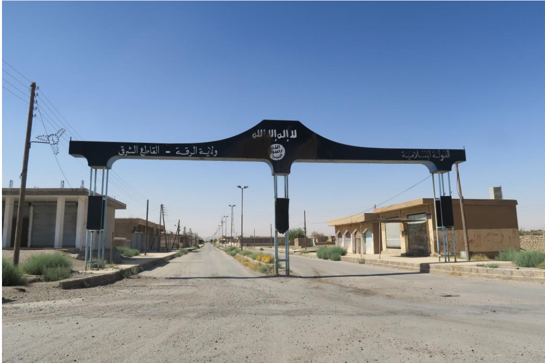
Leftover of so-called "Islamic State caliphate" east of Raqqa, now deserted.

Those who cannot afford to pay smugglers have one of two choices: either stay at home and risk being bombed or getting caught in the crossfire, or attempt to leave on their own and by so doing facing an even greater level of risk being killed by IS fighters or by the IS' mines and booby-traps.