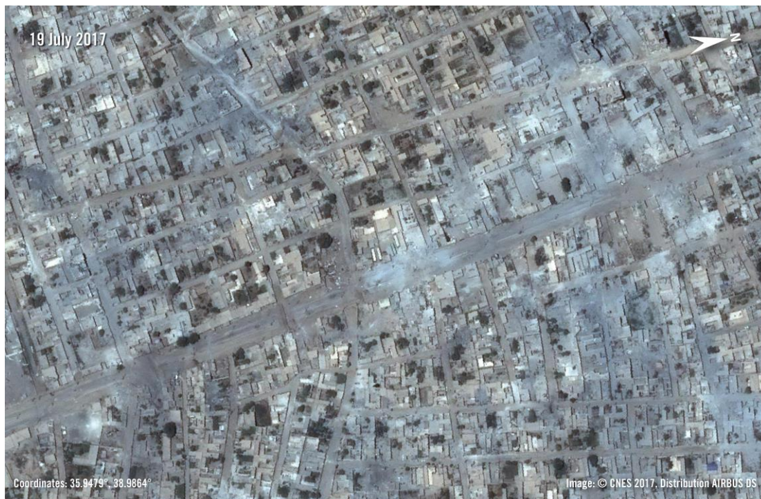
Raqqa, Ihsewa crossroad area. Imagery taken on 19 July 2017 after a series of strikes launched on 9 June. Coordinates: 35.9479°, 38.9864°.

It all happened in the space of a few minutes, sometime between 1 and 2pm, the shells struck one after the other. It was indescribable, it was like the end of the world – the noise, people screaming. If I live a 100 years I won't forget this carnage. Artillery shells are hitting everywhere, entire streets. It is indiscriminate shelling and kills a lot of civilians". 21