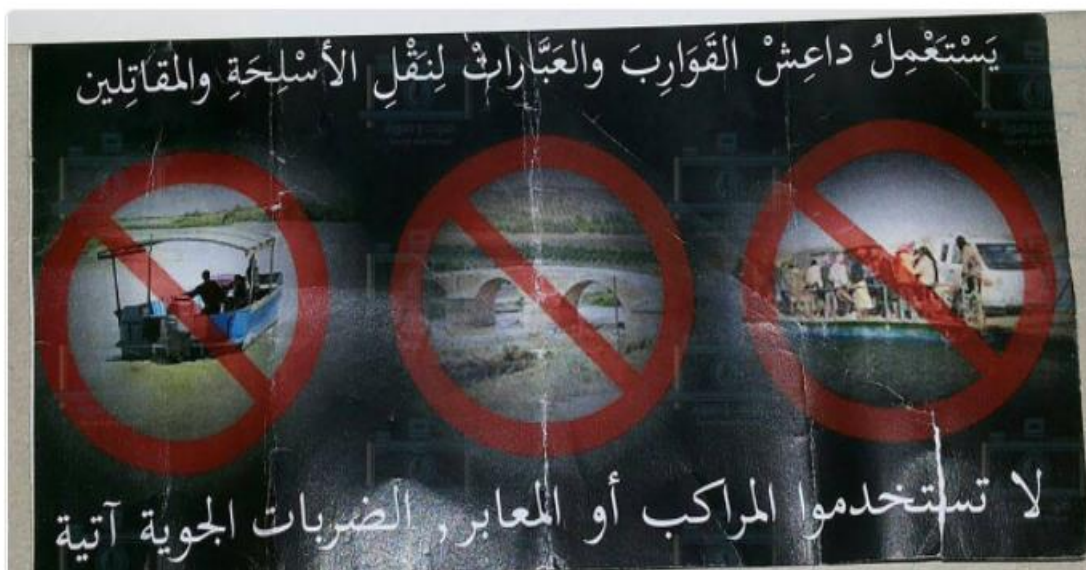
Leaflets dropped by the Coalition over Raqqa in March 2017.