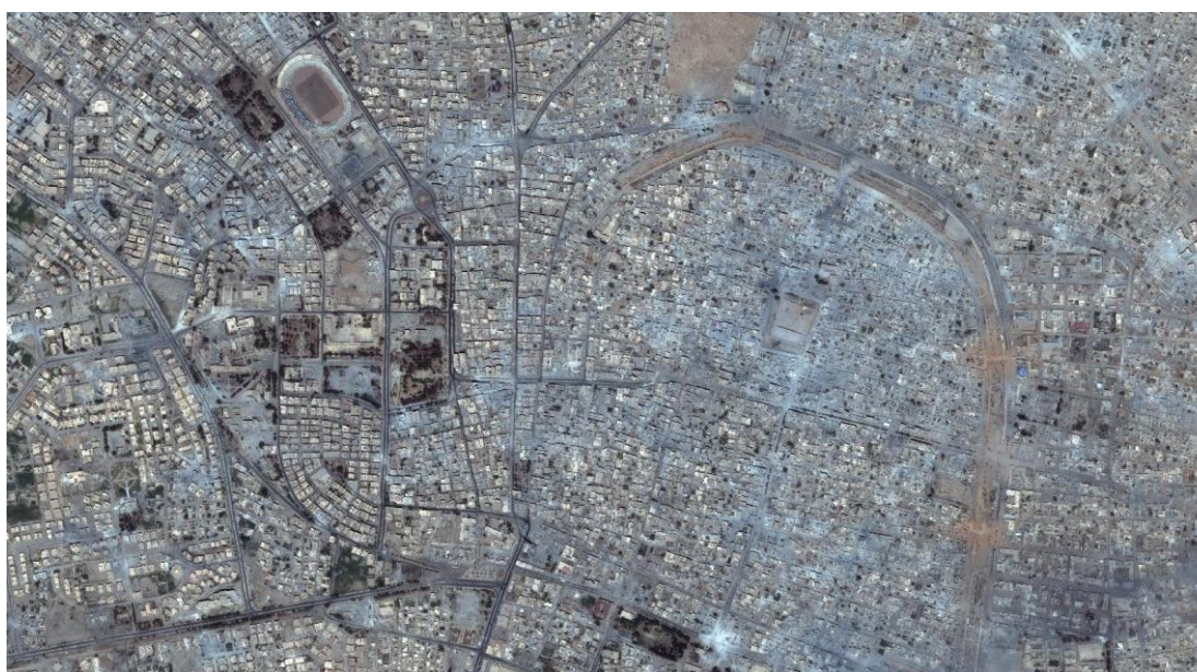
Raqqa Old City overview. Imagery taken on 19 July 2017.

IS fighters, for their part, use crude unguided projectiles, including locally manufactured mortars, and a host of improvised explosive devices (IEDs), including car bombs, all of which pose an inherent lethal danger to civilians. Moreover, the danger for civilian residents of getting caught in crossfire between the warring sides is all the more acute as IS fighters have been redoubling efforts to prevent civilians from leaving the city, using them as human shields while they launch attacks against SDF and coalition forces from amongst the