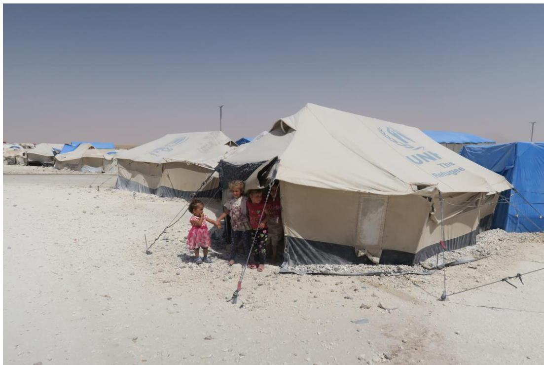
Children displaced by the battle in Raqqa sheltering in IDP camp in Ain Issa, northern Syria.

Syrian government forces lost control of Raqqa City to armed opposition groups including Ahrar al Sham and Jabhat al-Nusra in early March 2013, making Raqqa the first Syrian provincial capital from which government forces were expelled entirely since the beginning of the uprising in 2011. 9 After a brief power struggle with other armed groups, by the end of 2013 the IS had taken full control of the city, 10 which it held until June 2017, when the ongoing military operation to recapture the city was launched by the SDF and US-led coalition forces.