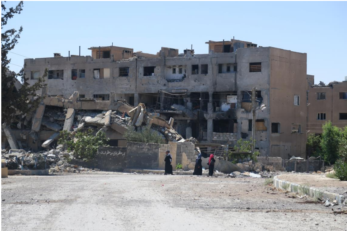
Families displaced by the conflict in Raqqa look for shelter in abandoned apartments in damaged and unsafe buildings in nearby towns previously recaptured from ISIS.

Notwithstanding these challenges, and in fact because of them, it is imperative that all the parties to the conflict take all feasible precautions to minimize harm to civilians; fully comply with the rules of international humanitarian law in the planning and execution of strikes and attacks - including by cancelling attacks that risk being indiscriminate, disproportionate or otherwise unlawful, and ending the use of explosive weapons with wide area effects in populated civilian areas, in compliance with the prohibition on indiscriminate or disproportionate attacks.