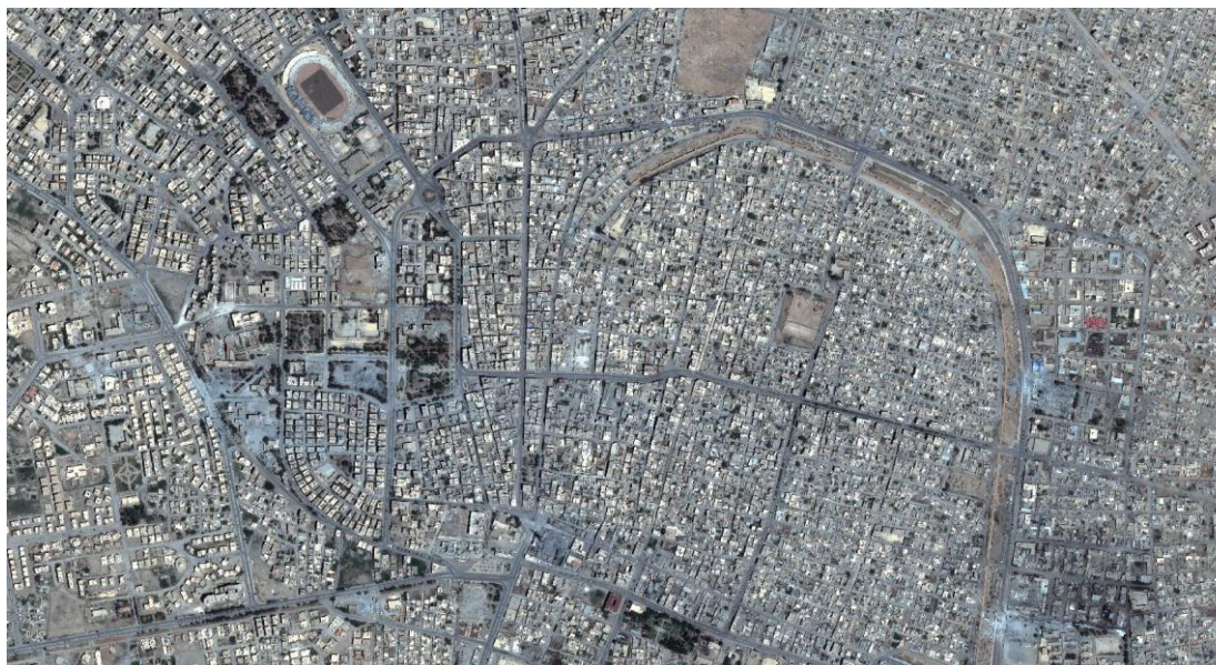
Raqqa Old City overview. Imagery taken on 2 June 2016.