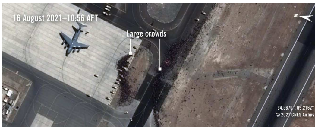
16 August 2021. Kabul Airport.

The thousands who are left behind, or are trying to leave Afghanistan, are testament to the brutal regime of the Taliban circa 2001, when extrajudicial executions abounded, and women and girls were oppressed with a plethora of restrictions. Since then, even in the last 20 years, the Taliban and other armed groups have conducted brutal attacks on civilians, journalists, human rights defenders, and government workers, resulting in Afghanistan having one of the highest civilian deaths in the world. 32 Nearly 50,000 civilians have died in the last 20 years. 33 The first half of 2021 alone recorded 5183 civilian casualties (1,659 deaths and 3,524 injuries), of which 32 per cent were children. This is a 47 per cent increase in civilian casualties compared to the same period in 2020. 34 Those responsible for these casualties include both anti-government and pro-government forces. 35