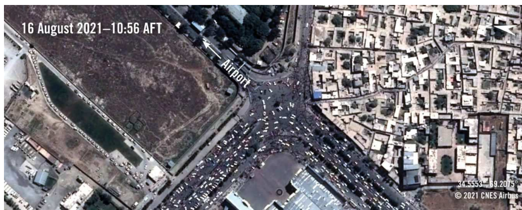
Kabul Airport vicinity. 16 August 2021.

In this report, Amnesty International, International Federation for Human Rights (FIDH) and the World Organisation against Torture (OMCT) have documented incidents of human rights violations that have taken place in Afghanistan since the takeover by the Taliban on 15 August. This report calls on the UN Human Rights Council (UNHRC) to take decisive action to establish a robust independent investigative mechanism to monitor and report on human rights abuses committed in violation of international human rights law, and to contribute to accountability for crimes under international law. Human rights defenders, journalists, and others who are targeted for their work must be evacuated and given safe passage if they wish to leave Afghanistan; and women and girls, and ethnic and religious minorities who are targeted because of their gender, ethnic, and religious identity, must be guaranteed protection. All those who wish to leave Afghanistan must be assured the right to seek asylum. At the same time, the Office of the Prosecutor of the International Criminal Court must receive assistance from the international community to immediately recommence its investigations into crimes under international law committed in Afghanistan.