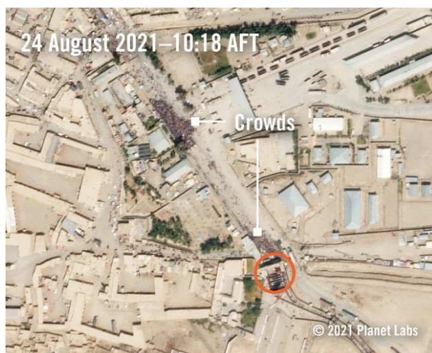
Spin Boldak-Chaman crossing. 24 August 2021. Planet Labs.

For instance, according to UNHCR, Pakistan closed its border with Afghanistan, except for people in need of medical treatment, or with a proof of residency. 186 Despite that, at the Spin Boldak-Chaman border crossing in Kandahar, people with Tazkira (National ID Card) from Kandahar, Helmand, Zabul, and Uruzgan were allowed to cross the border. Between 2 August 2021 and 24 August 2021, the crowds attempting to cross the border to Pakistan via the Spin Boldak crossing increased exponentially, as documented via satellite imagery (see above) and video analysed by Amnesty International.