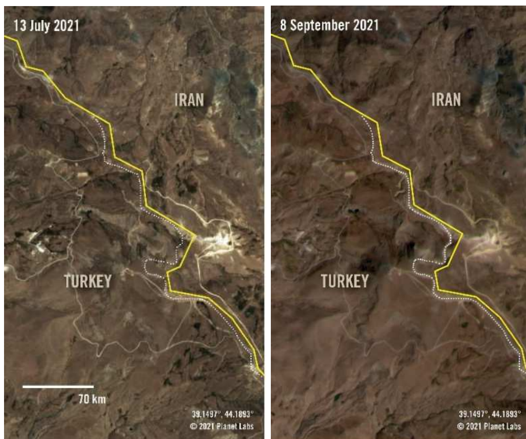
New Construction along the Turkey-Iran border between 13 July and 8 September, 2021.

An additional obstacle for Afghan people seeking to flee abroad seems to be the lack of passports. According to the Afghan researcher who spoke to Amnesty International, Afghan authorities currently do not deliver passports and Afghan people are not allowed to cross border without passports. 199